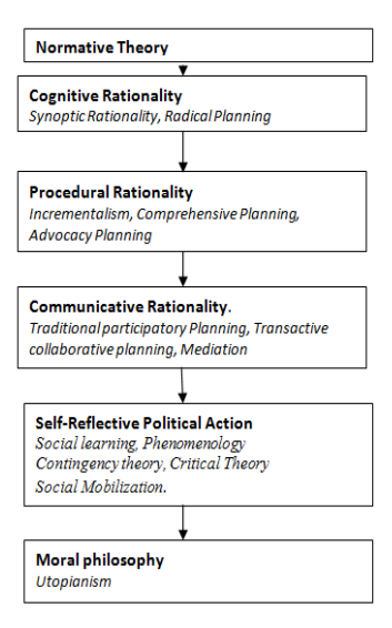
Figure 1: Gravitations in the Theoretical Build-Up of Town Planning

Master planning approach became identifiable with academic training during the first four decades of the 20<sup>th</sup> century; as a response to the spatial disorganization and living deprivations that the world's rapidly industrializing cities were generating. It emerged when there were strains of urban and anti-urban ideologies competing for dominance; as the explanations of the plight confronting cities in the late 19<sup>th</sup> and the early 20<sup>th</sup> centuries.